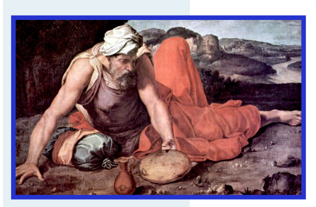
"I have had enough." - Elijah in the Desert